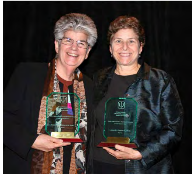
Distinguished Humanitarian Contribution Award for 2010.